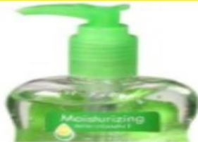
Large Bottle of Hand Sanitizer