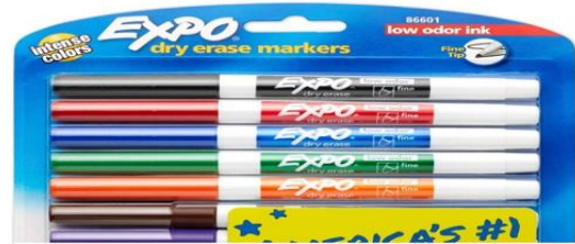
Fine Tip Expo Markers