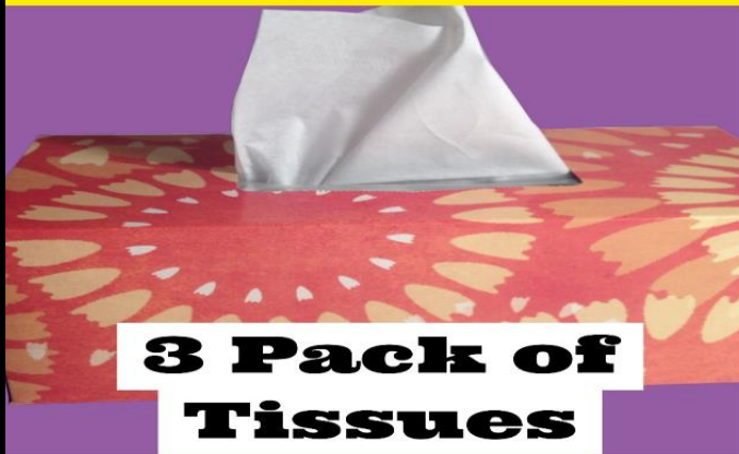
3 Pack of Tissues