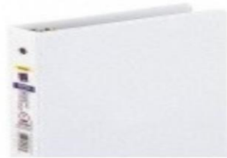
1 inch binder with pockets