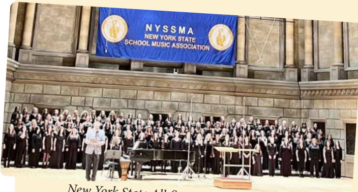
New York State All-State Treble Chorus