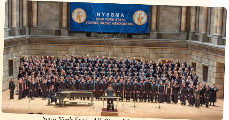
New York State All-State Mixed Chorus